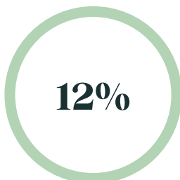
Average annual carbon reduction*.

Out of the members all that achieved an absolute reduction.