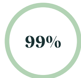
Success rate for members achieving renewal.

Out of the members that achieved a per employee reduction.