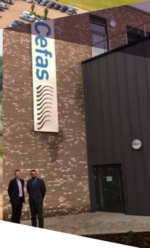
Photos: Norwich Research Park is a hub for life and plant science and research. The CEFAS laboratories in Lowestoft have been redeveloped with support from our Growth Deal. Commercial drone firm HexCam purchased new equipment thanks to support from New Anglia Growth Hub

Twitter @NewAngliaLEP LinkedIn New Anglia Local Enterprise Partnership