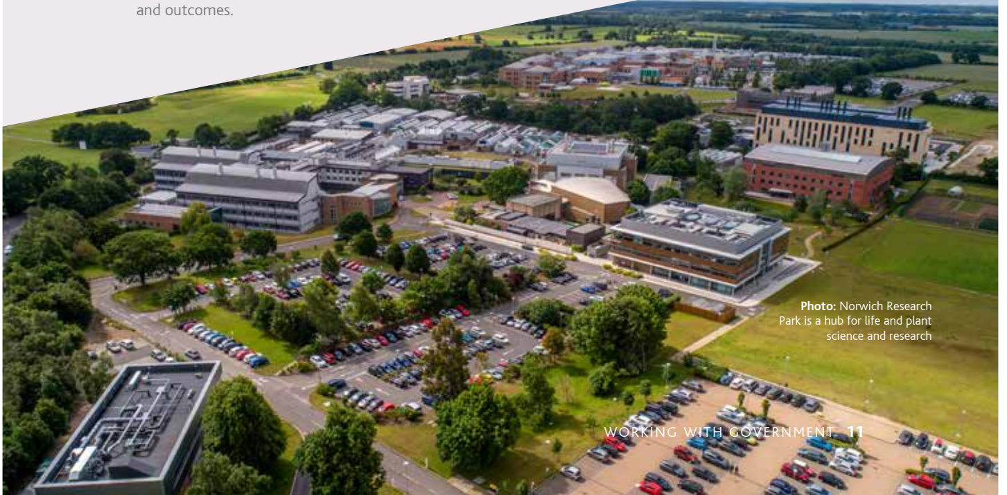
Photo: Norwich Research Park is a hub for life and plant science and research

The LEP's Innovation Board has been re-established. It includes representation from our major innovation hubs, research centres and universities. A number of innovation projects have been supported over this past year, for example the establishment of a regional base for the Offshore Renewable Energy (ORE) Catapult in the Orbis Energy Centre in Lowestoft.