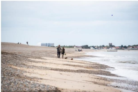
Could Suffolk and Norfolk's huge coastline attract staycationers looking for a quiet getaway this summer?