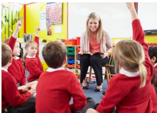
Norwich Opportunity Area runs projects with schools to help boost the life chances of disadvantaged children.

PUBLISHED: 16:21 17 July 2020 | UPDATED: 16:21 17 July 2020 | Simon Parkin